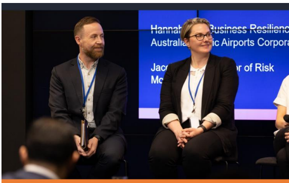
(Pictured above: the industry panel in action at the Melbourne workshop in June).

Our workshop program also includes a panel discussion on all-hazards risk management with a focus on best practice approaches, featuring expert industry guests.